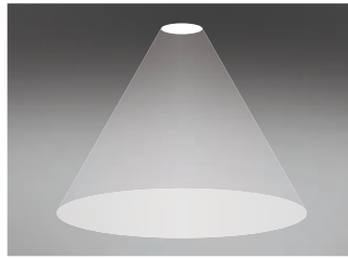
/WB Wide beam reflector