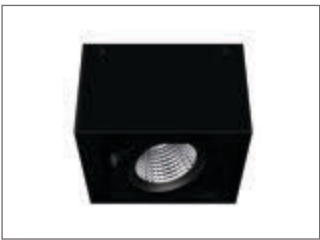
/B Black body and gimbal