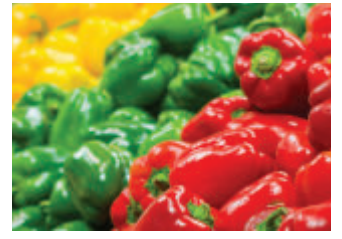
/R9 High colour rendering (Ra 90)