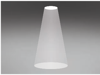
/NB Narrow beam reflector