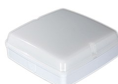
OPAL - WHITE