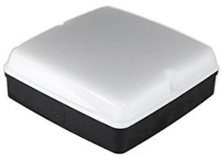
OPAL - BLACK