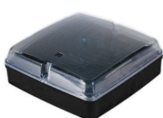
CLEAR - BLACK