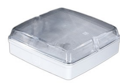
CLEAR - WHITE