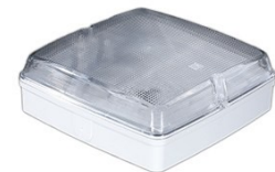
CLEAR - WHITE