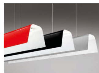
Linear pendants available Please see 127 Series datasheet