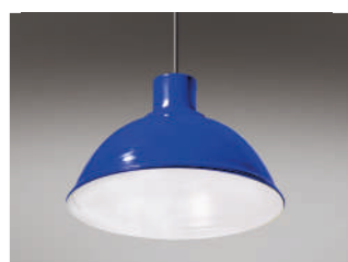
Product variations Other colours and specifications available on request