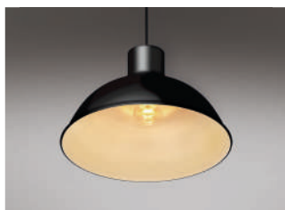
126.002 Warm dim (E27)