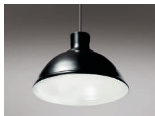
/B Black satin outer, white satin inner