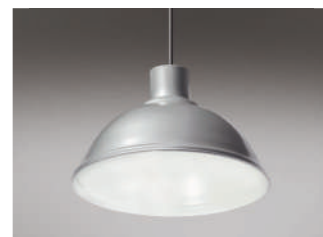
/G Grey satin outer, white satin inner