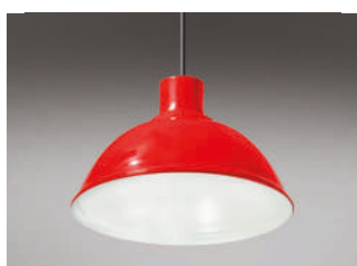
/R Red gloss outer, white satin inner